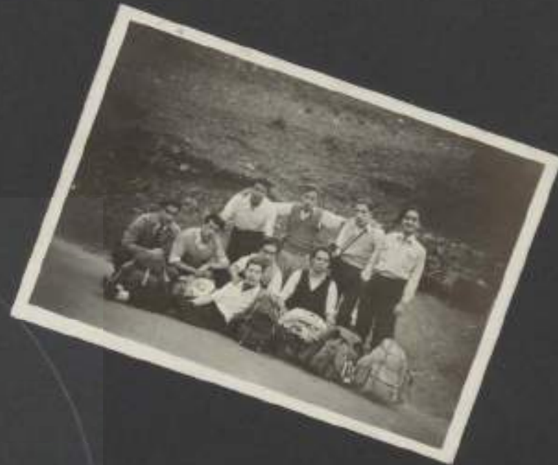
Acampamento no Trancão