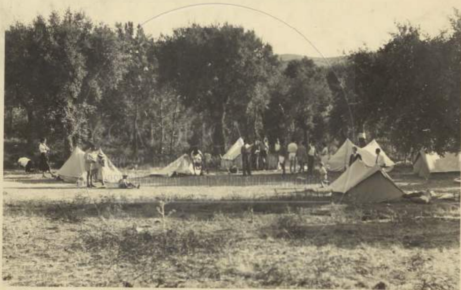
Acampamento Geral 1954